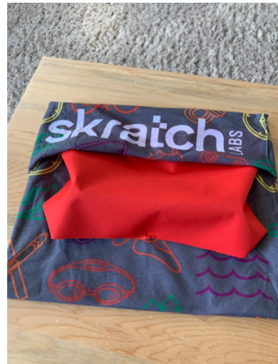
You can fold the tube into itself to create a more secure fit.