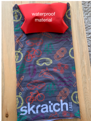
Gaiter w/ waterproof material sewn to top & lightly secured at corners & side.

Your finished product will look something like this: