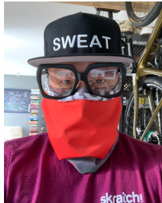
Wear it like this and don't forget to protect your eyes.